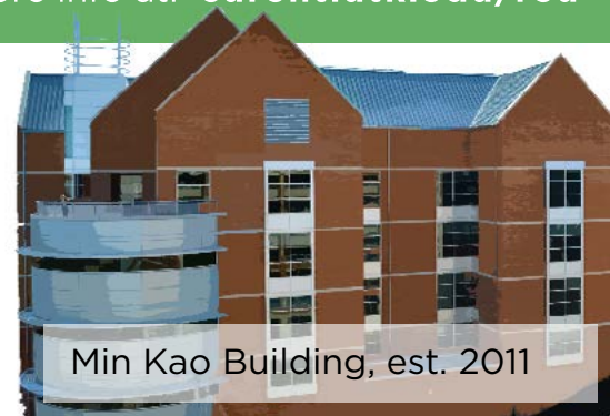
Min Kao Building, est. 2011