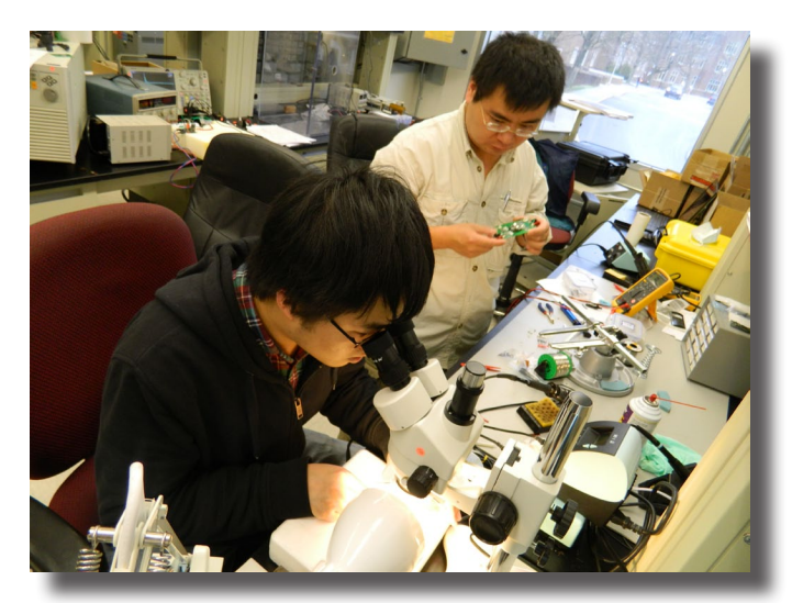
research page 6