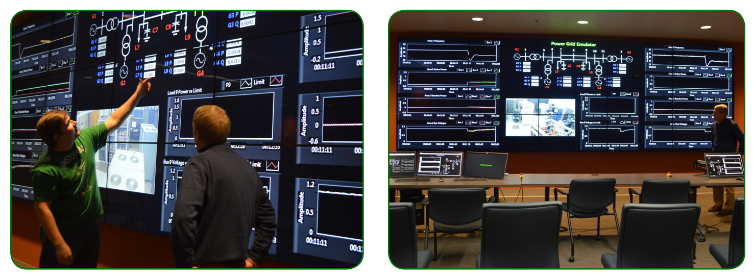
Above: Working in the Visualization Room, MHK 124

The LTB provides a testing platform to validate and verify new models and control technologies developed in CURENT. It also serves as a driver of research since it allows fast prototyping of new models and grid infrastructures, direct access to simulation and measurement data, and instant feedback of the wide-area control signals. Thus, it is of critical importance to the success of the CURENT research visions.