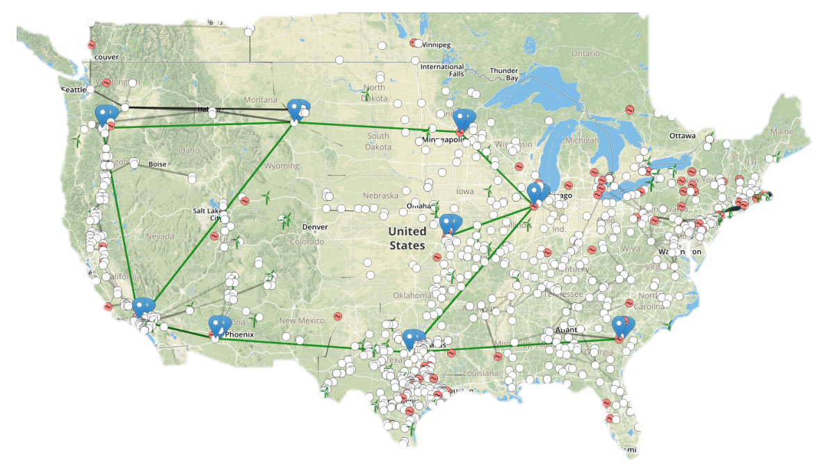
Figure 3: Visualization of the 1,000-bus CURENT system with 50% wind and a nine-terminal HVDC

Large-scale Test Bed (LTB) for Innovations in Wide-Area Power System Technologies (cont.)