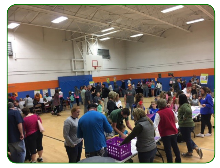
Above: Family Engineering Night - Clinton Elementary

Over 1550 parents, teachers, and students attended the seven Family Engineering Nights for Year 7.