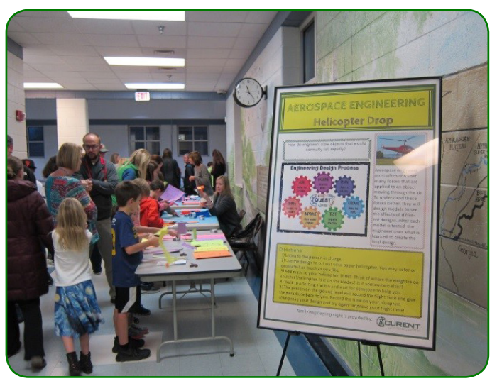
Above: Family Engineering Night - Sequoyah Elementary