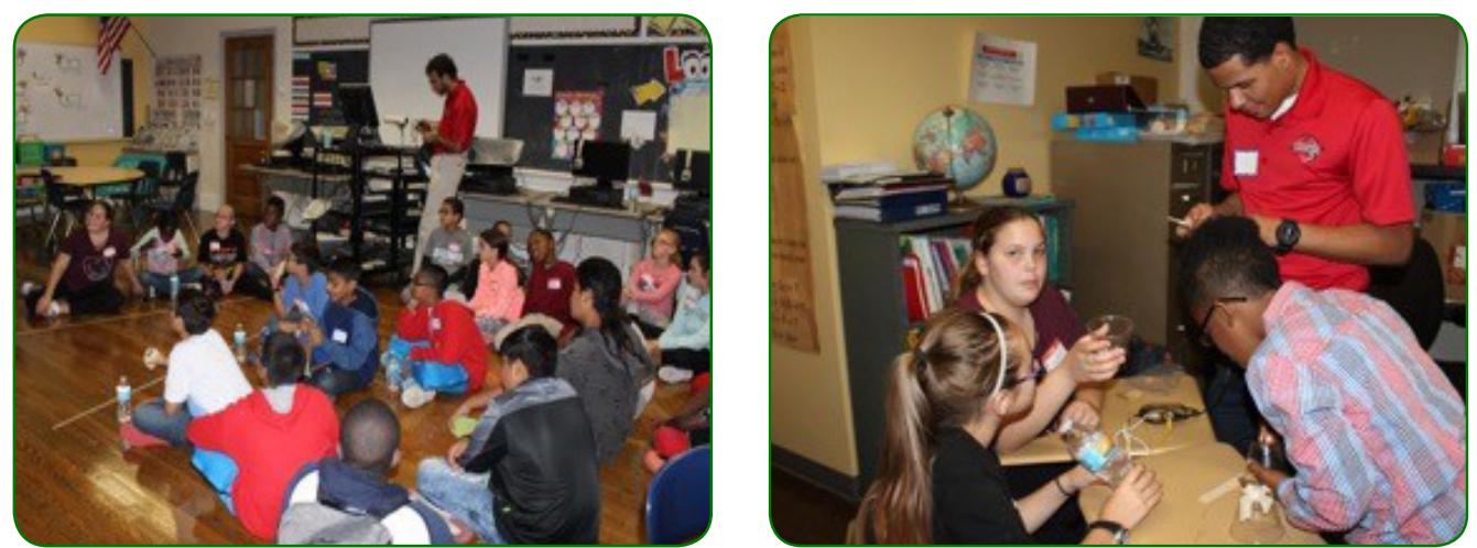
Above:: RPI Rise High Recruitment Night on October 19, 2017

The RPI Engineering Ambassador also presented the Wind Energy topic at a Rise High http://rise-high.org/ recruitment event for a new multi-year program to begin in the spring semester for students within a seriously challenged community. The RPI Engineering Ambassador will be supporting the Rise High Saturday morning program in the spring semester beginning with the topics of Energy: mechanical, thermal and electrical energy.